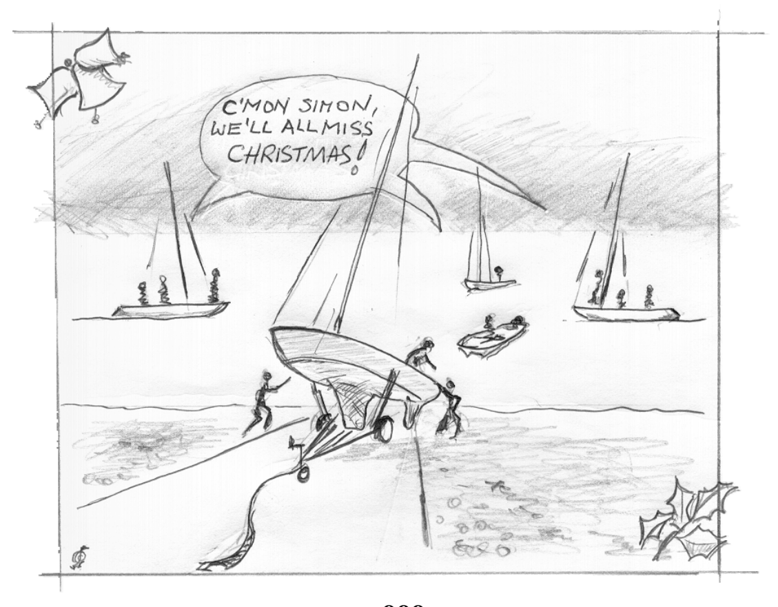
--- 000 ---