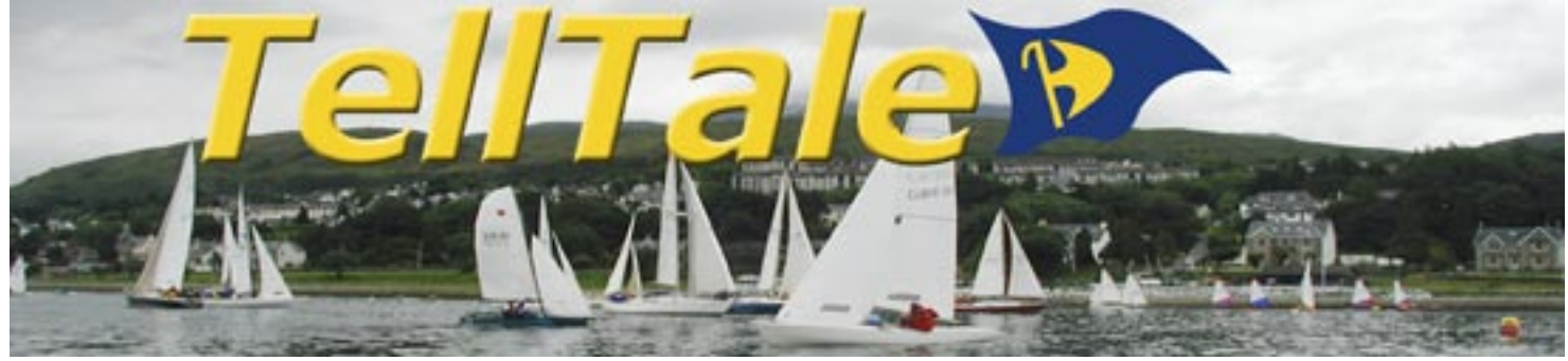
The official newsletter of Lochaber Yacht Club, Fort William