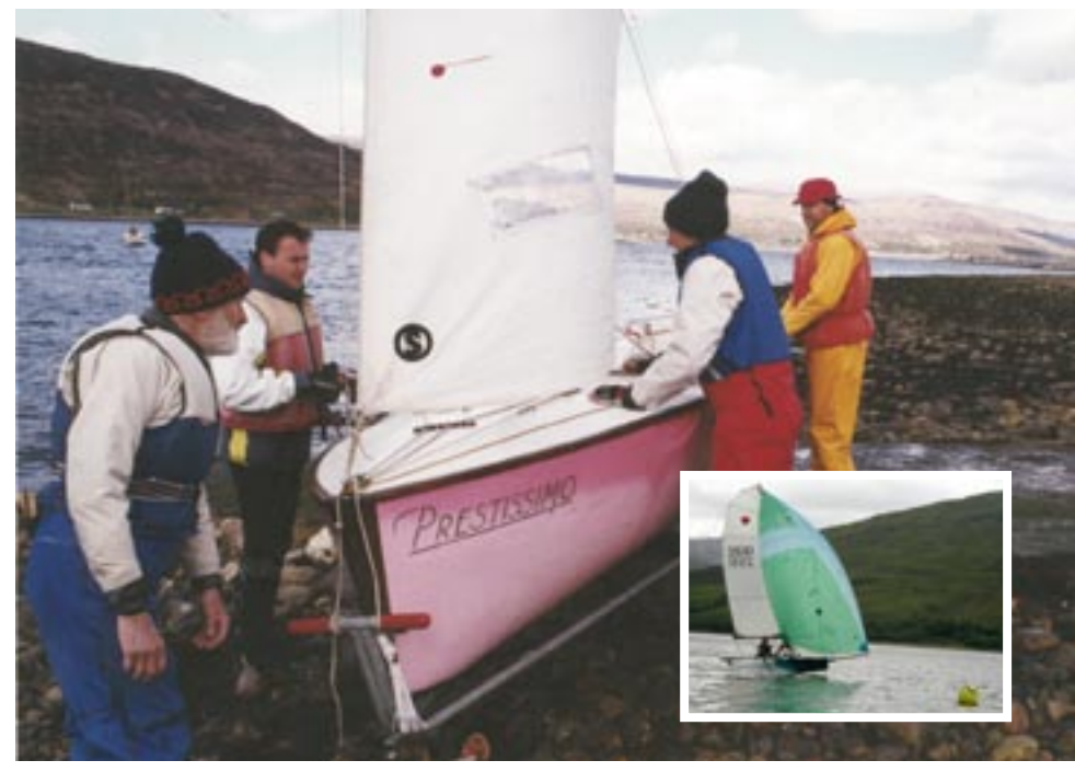
Preparing to launch a Bosun dinghy. Instructors and students have to wear protective clothing against the heat of the sun in April... Inset photo - power sailing in a Cherub dinghy - this could be you one day!

numbers and places will be allocated on a first come first served basis.