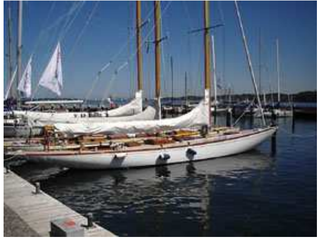
Butter would melt on the deck!

Extract from a knitting book I have been writing for the last 30 years -