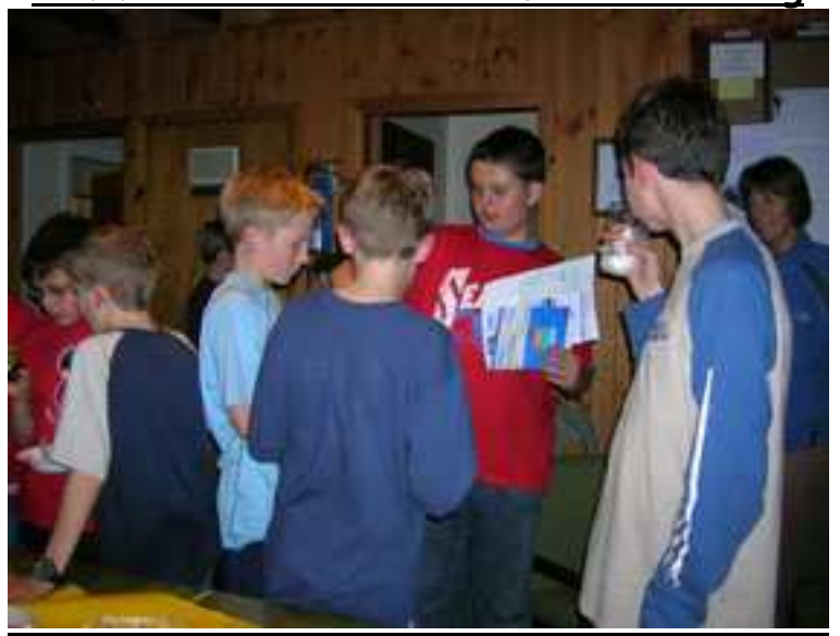
Where have all the young ones gone?

In response to several jibes (not the sailing type!) about the youngsters of the club deserting it to compete elsewhere, I felt it was time to explain our side of the equation.